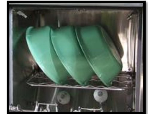
Bowl rack in position with items loaded

Only ONE of the above racks can be in position at any one time