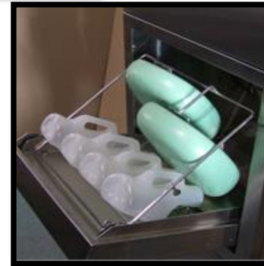
Urine/Bedpan rack in position with items loaded